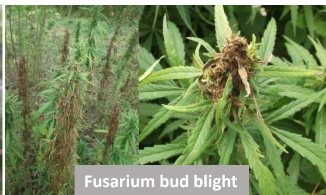
Fusarium bud blight

Powdery mildew occurs widely in greenhouses. Biocontrol products and varietal resistance are being evaluated as future control methods.