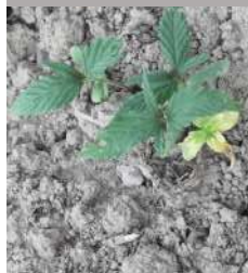
Pythium seedling blight

Seed rots and seedling blights are caused by seedborne and soilborne microbes, particularly by the oomycete Pythium and fungi in the genera Fusarium , and Rhizoctonia .