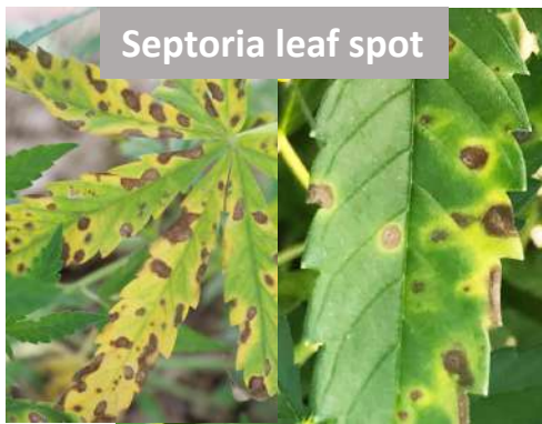
Septoria leaf spot