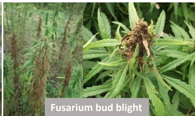
Fusarium bud blight

Powdery mildew occurs widely in greenhouses. Biocontrol products and varietal resistance are being evaluated as future control methods.