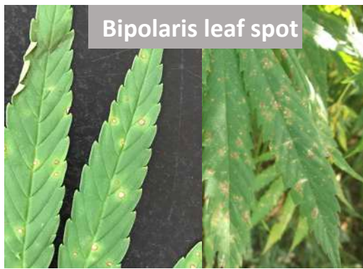
Bipolaris leaf spot