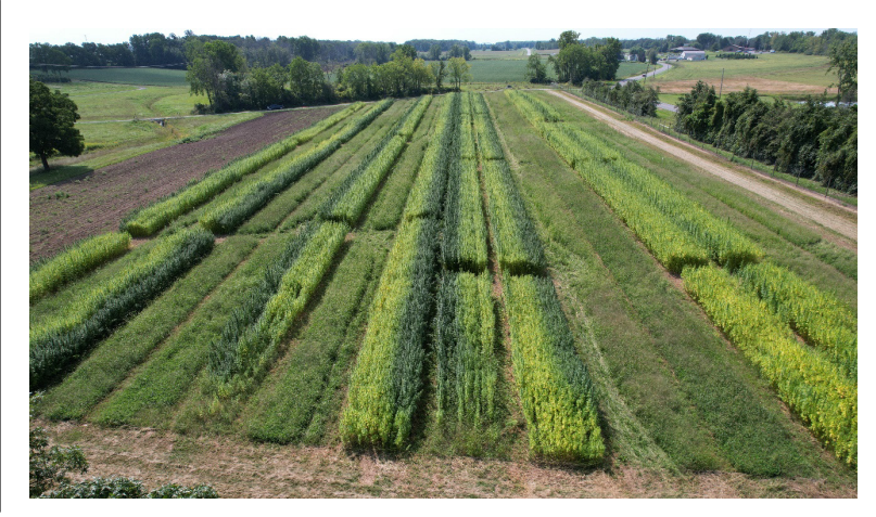
Aerial image of 5-acre hemp + red clover rock dust trial field in August 2021

As of early February 2022, we are awaiting soil chemistry results to fully assess soil carbon benefits and soil chemistry impacts from rock dust. This trial will continue for at least 2 more years, and includes a red clover – hemp annual rotation.