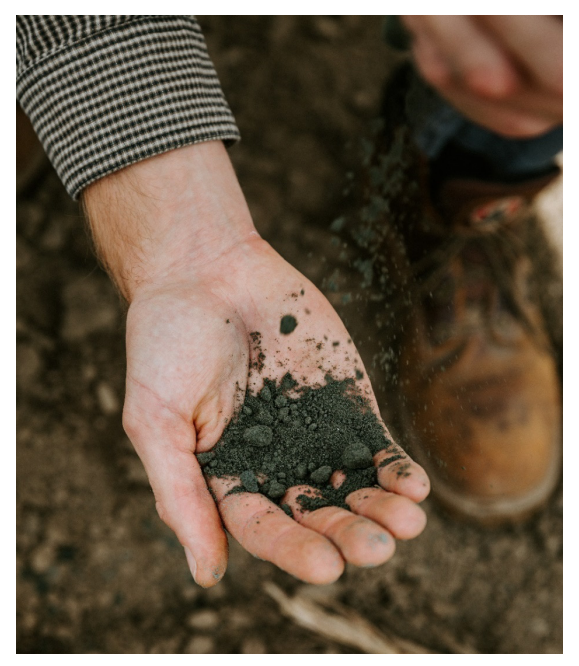
Basalt rock dust is very fine, and dissolves over time in soils

Moderate carbon credits could be generated from rock dust application rates that also improve hemp yield. Higher rock dust application rates show higher soil carbon sequestration potential, which may generate greater financial incentives, but may also reduce hemp yield. Ultimately, a farmer's goals, based on economic incentives for hemp productivity versus carbon credits, should inform the amount of rock dust applied.