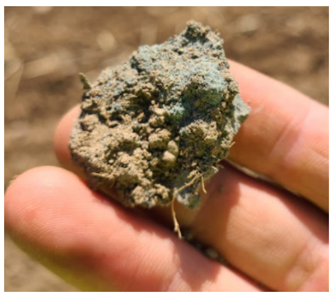
Basalt rock dust (grey) mixed with soil (brown) in the hemp field.

Basalt rock dust - pulverized to a grain size ~100 micrometers, often produced as a byproduct of mining operations - can be applied to cropland soils to provide beneficial micronutrients (e.g., silica, boron), and to remove carbon dioxide from the atmosphere through a process known as "enhanced weathering." Rock dust may improve the value of fiber hemp by reducing greenhouse gas emissions through lower fertilizer application and by generating "carbon credits" for farmers to sell to carbon offsets purchasers.